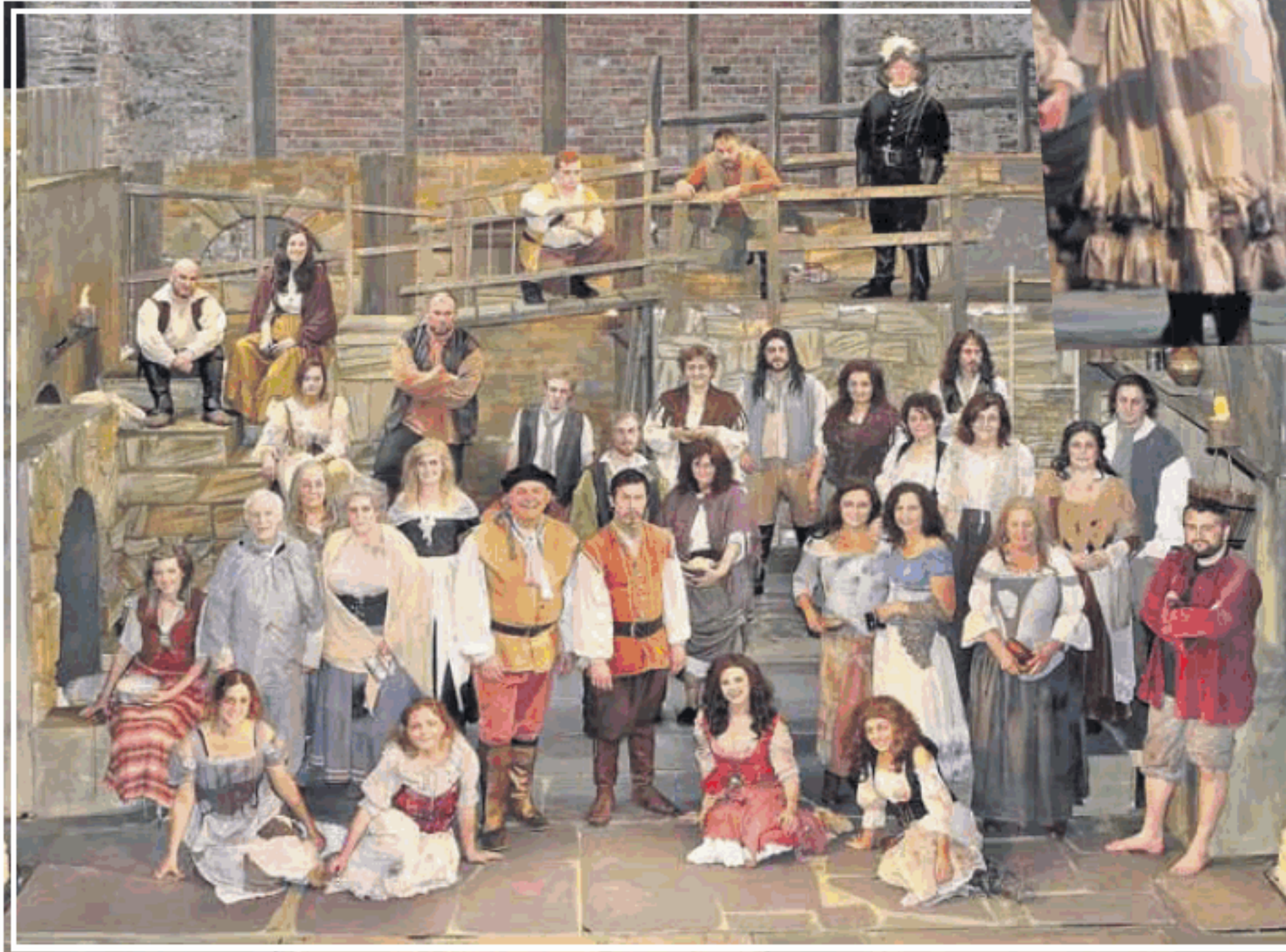
All in it together: the cast of WMS's 'Man of La Mancha'.

Waterford Musical Society was right 'to dream the impossible dream' and I know the world of musical theatre 'will be better for this' as they reached 'the unreachable star'.