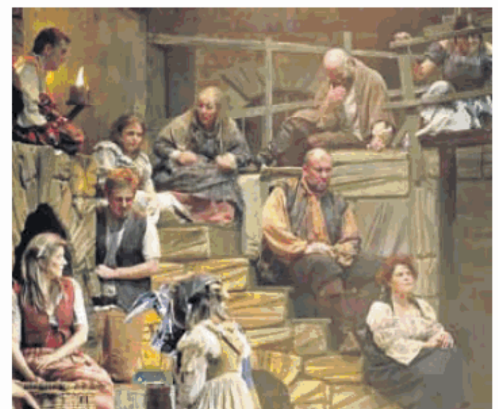
The chorus ably aided and abetted the story telling during WMS's third musical outing.